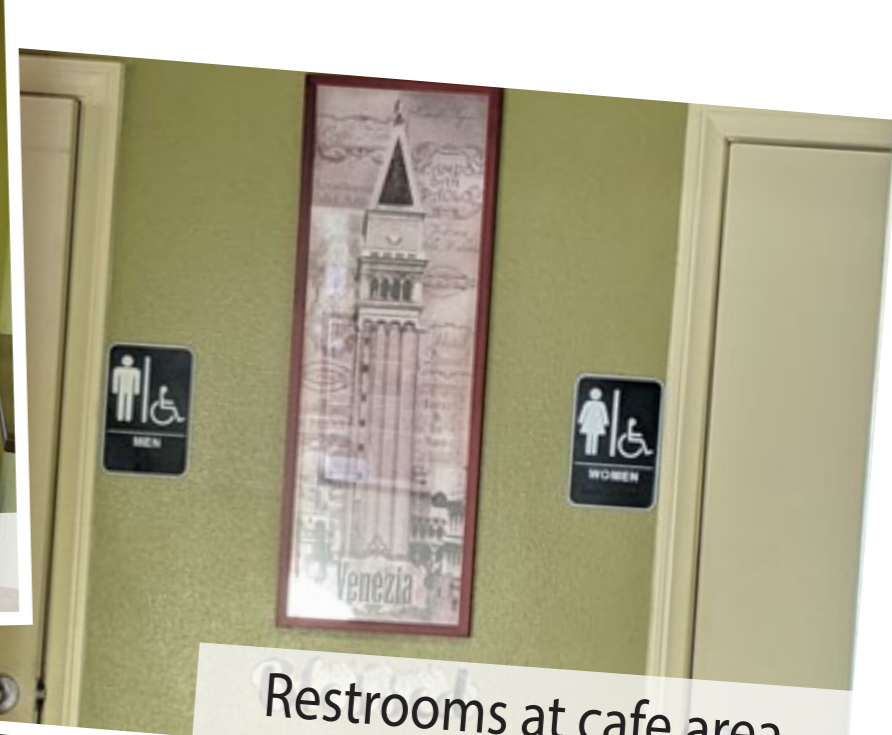
Restrooms at cafe area