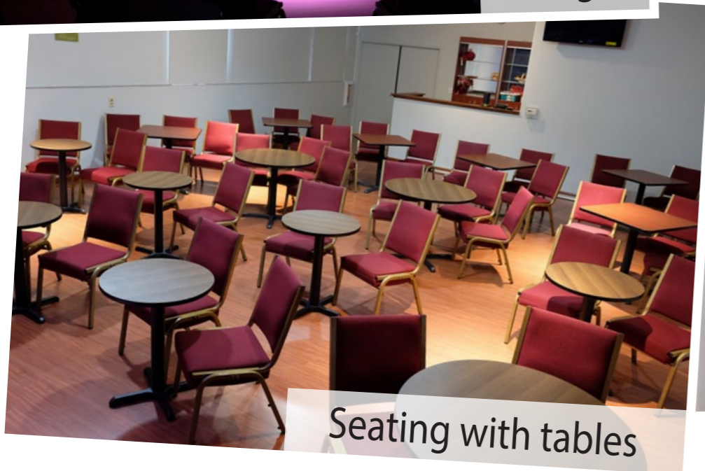
Seating with tables